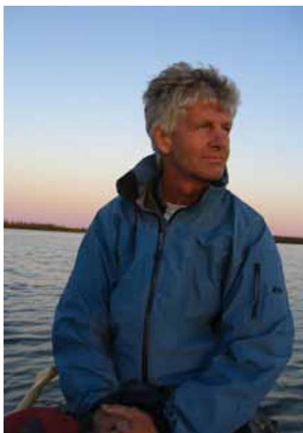
Robert G. Clark Distinguished Graduate Supervisor Award