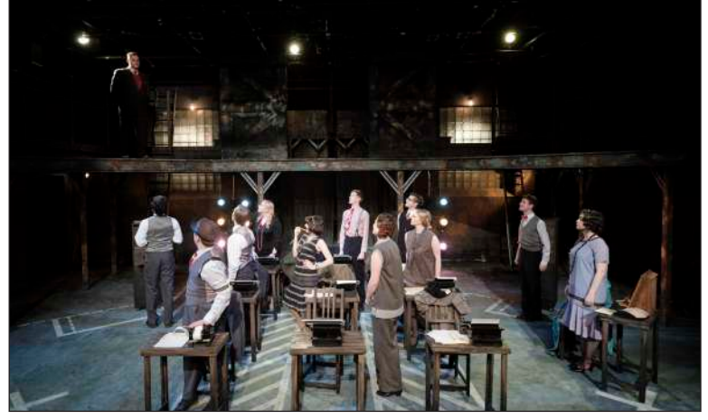
Episode 1: To Business (Cast looking up to their boss)